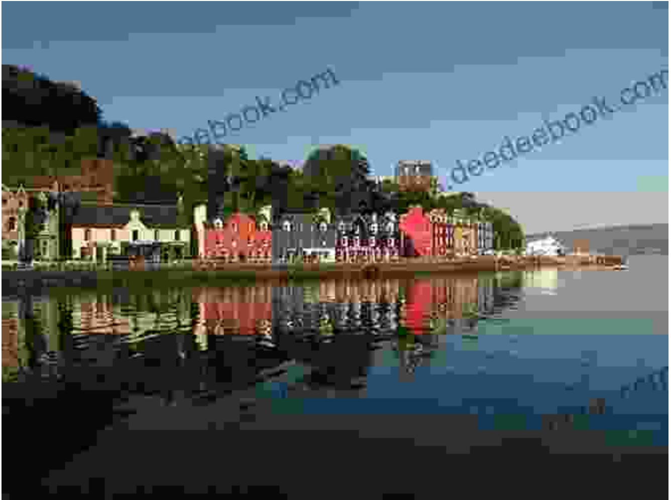
Tobermory, Isle of Mull