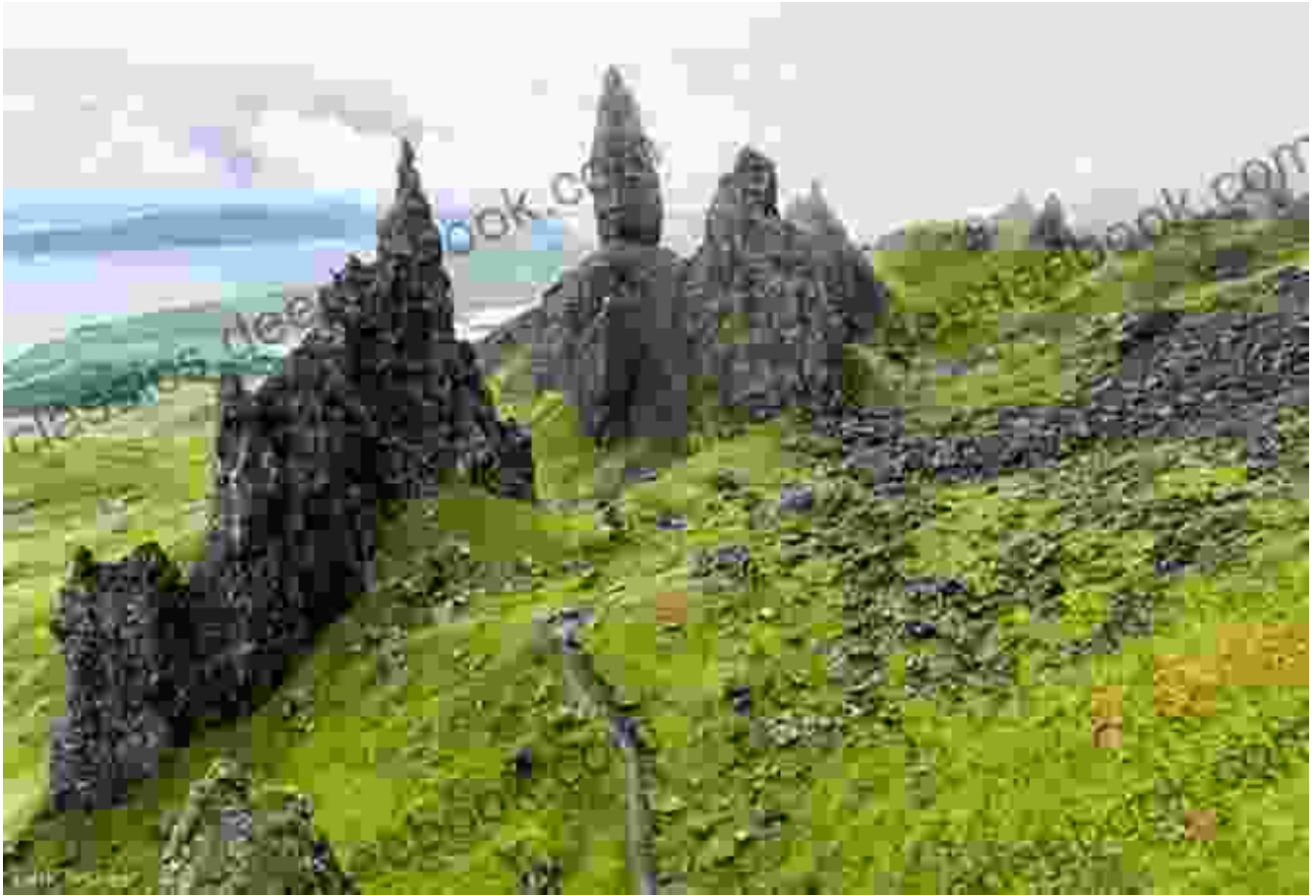
Old Man of Storr, Isle of Skye