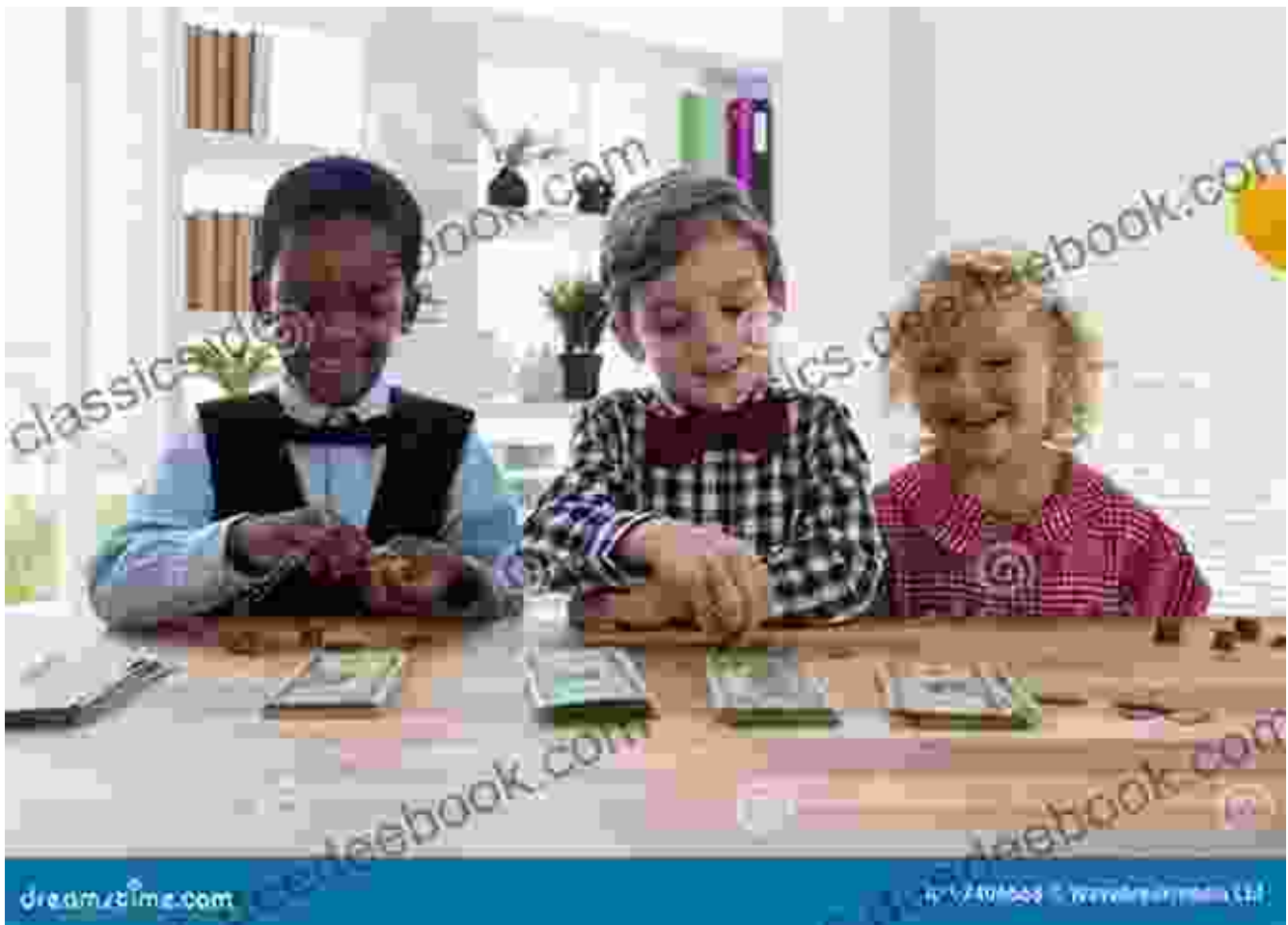
Caption: Millionaires know the secrets to building wealth.

By following these tips, you can increase your chances of building wealth and achieving financial freedom.